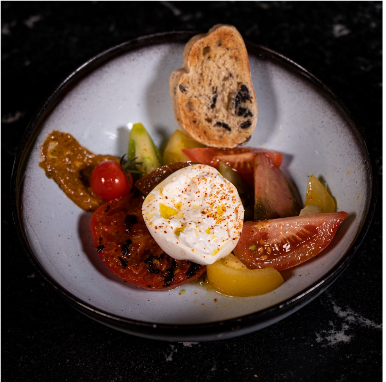
Around the Tomato