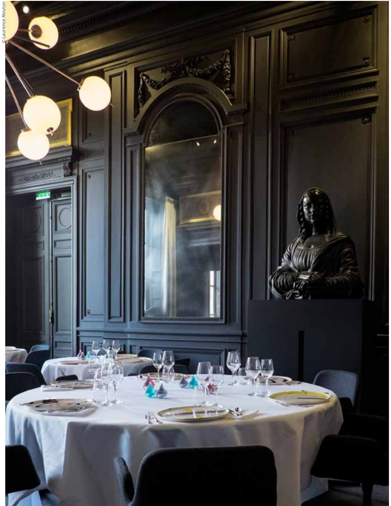
Restaurant Guy Savoy: lounge Belles Bacchantes