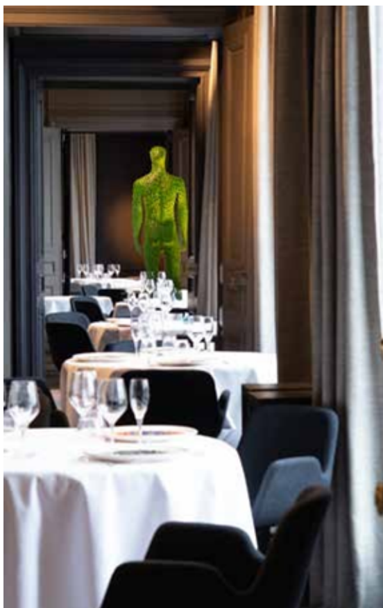
Restaurant Guy Savoy, the lounges in a row