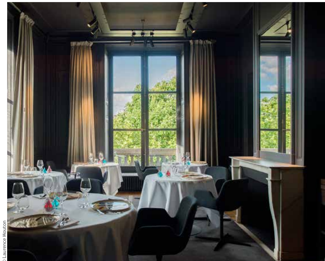
Restaurant Guy Savoy, Monnaie de Paris, lounge Scènes de Paris