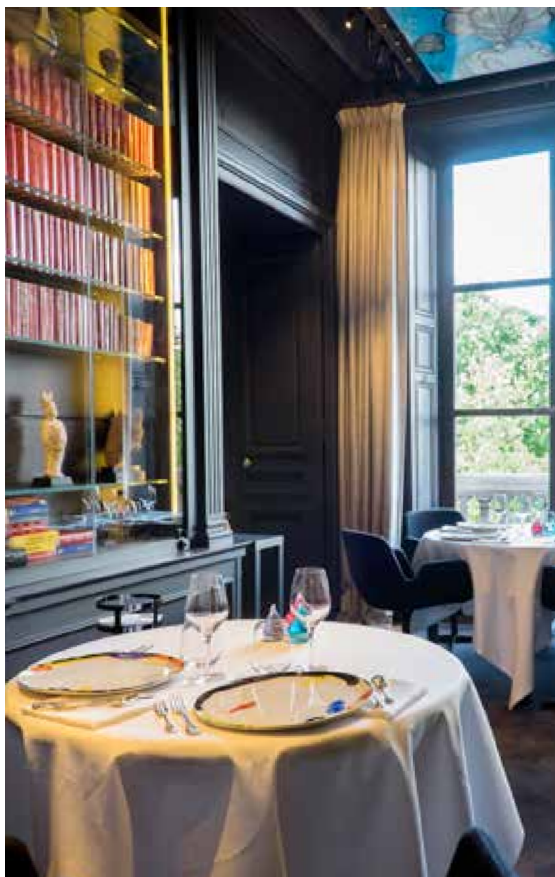
Restaurant Guy Savoy library