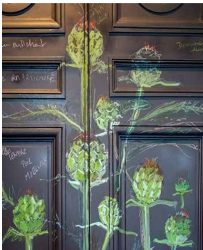
Artichauts (Dessine-moi un artichaut), Fabrice Hyber, 2018