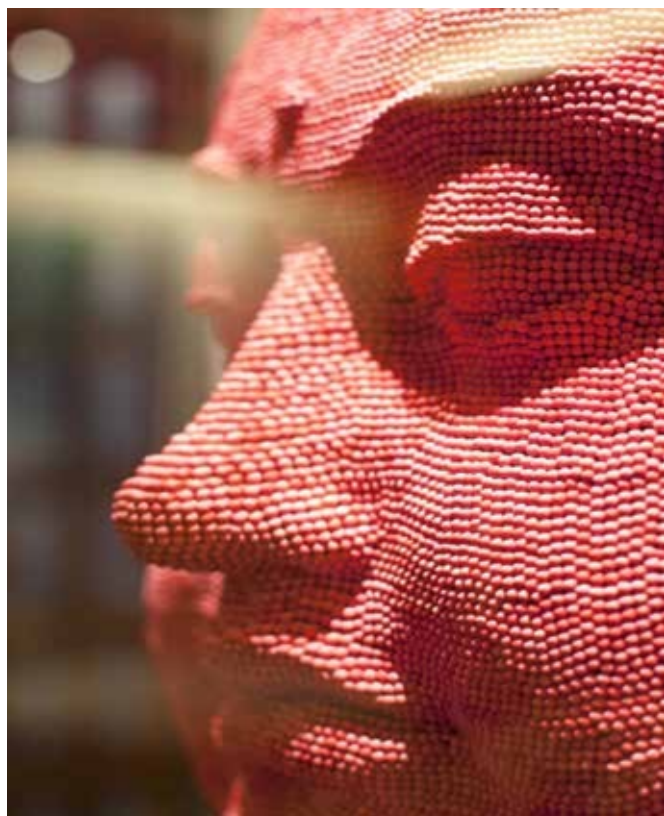
Bouddha Head, David Mach, 2007