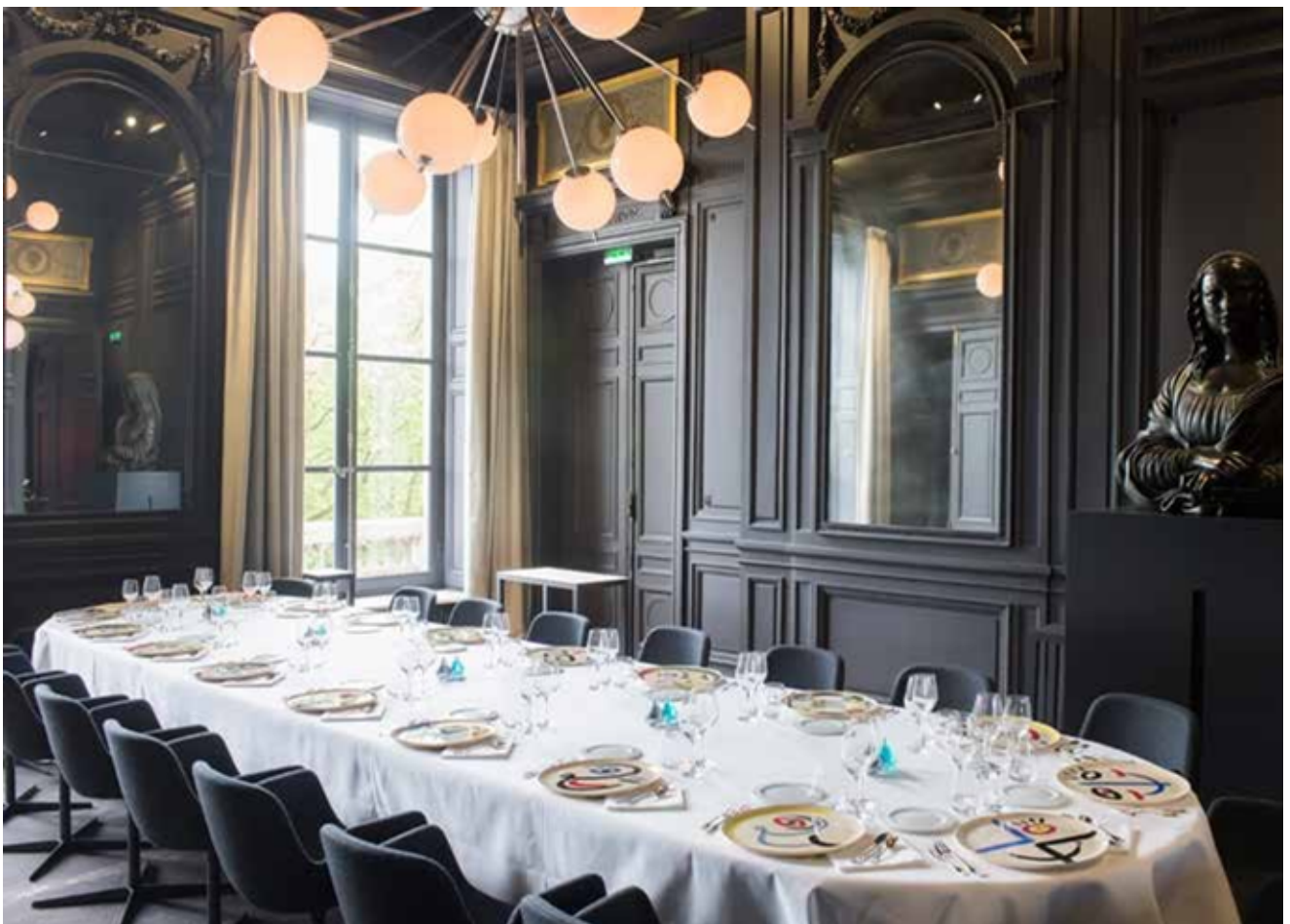
Restaurant Guy Savoy, lounge Belles Bacchantes

The harmony of a table can only be born with the complicity of those who toil behind the scenes. Guy Savoy and his teams work side by side with artists and designers to conceive and produce each object present on the restaurant's tables. It is this harmony between the objects themselves and the people engaging with them that suffuses the dining rooms with their uniquely peaceful ambience.