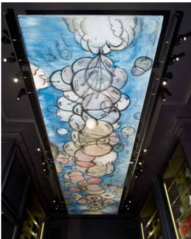
Effervescence, Fabrice Hyber, 2015