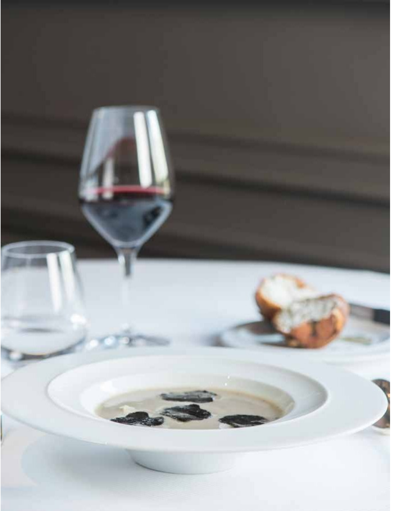
Artichoke soup with black truffle; layered truffle mushroom brioche and more ...