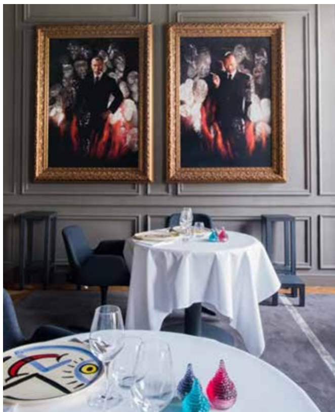
Autoportrait à la cigarette, Pierre et Gilles, 1999